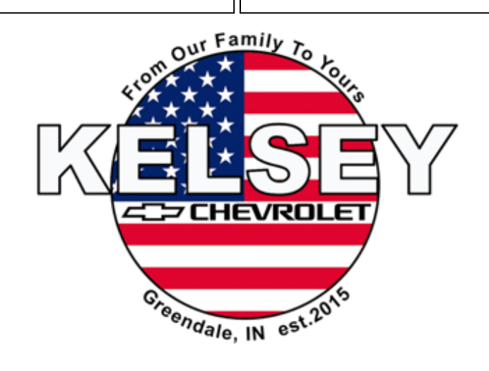
The Side Draft 3