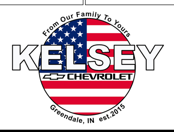
The Side Draft 3