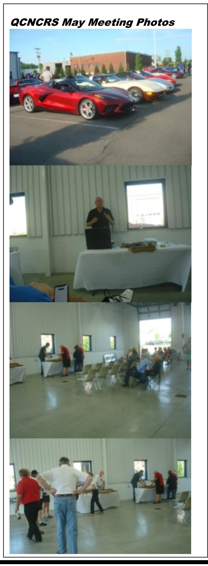
The Side Draft 5