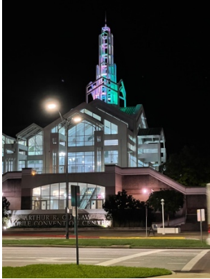
Convention center at night