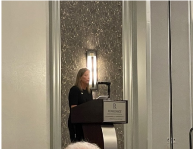
NCRS President addressing the membership