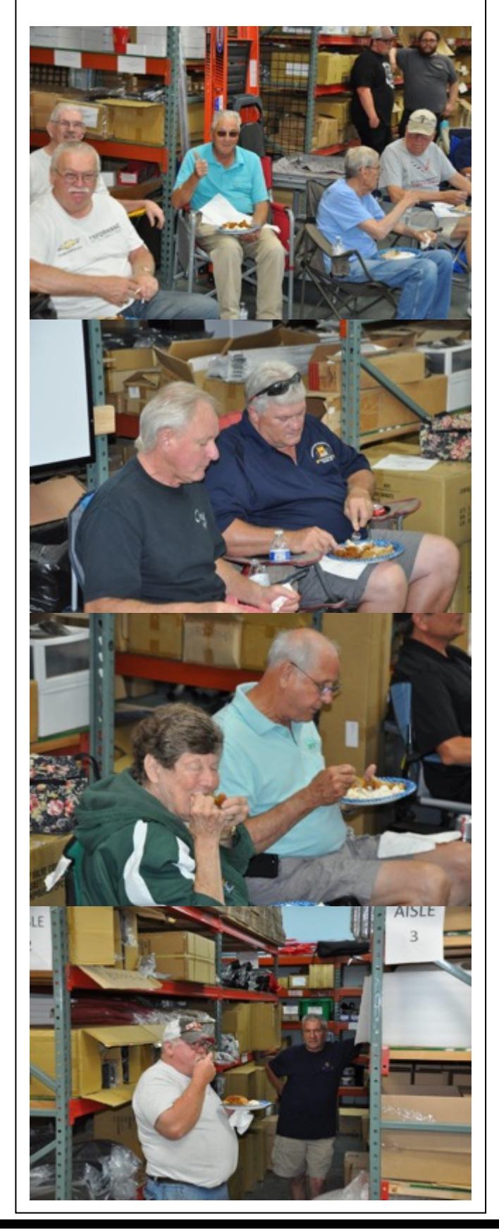
The Side Draft 5